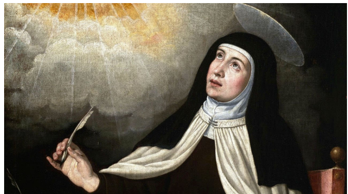
ST. TERESA OF AVILA VIRGIN AND DOCTOR OF THE CHURCH FEAST DAY—OCTOBER 15

The Memorial of St. Teresa of Avila is October 15