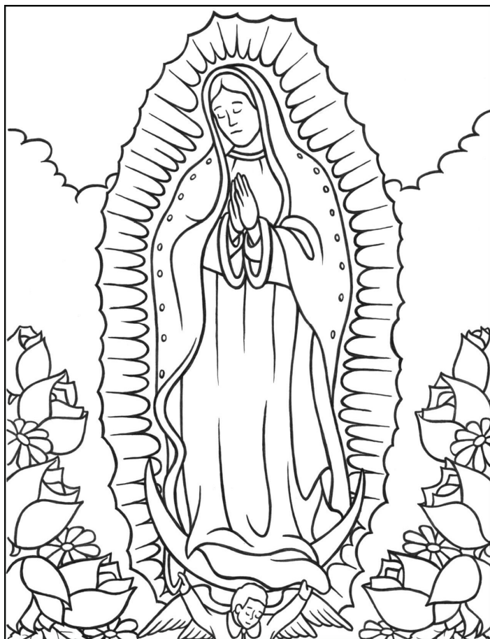
Our Lady of Guadalupe

Check out our updated website: www.ourladyoflourdesmontoursville.org