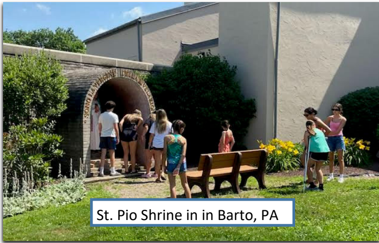
St. Pio Shrine in in Barto, PA