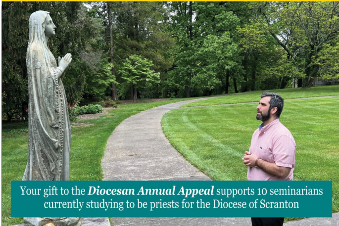
Your gift to the Diocesan Annual Appeal supports 10 seminarians currently studying to be priests for the Diocese of Scranton