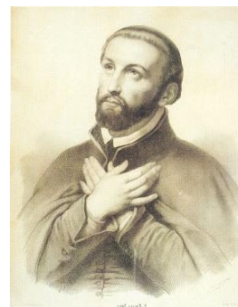
St. Francis Xavier Feast Day—December 3

This activity is sponsored by OLOL Teens.