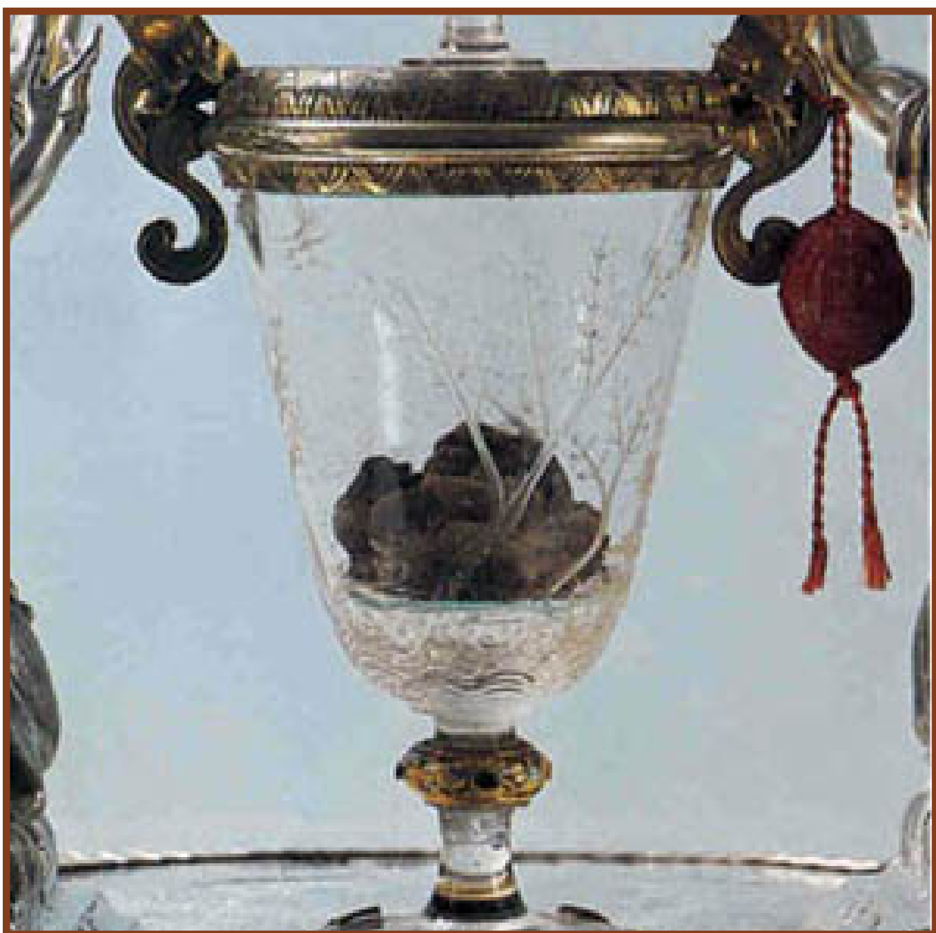
The five coagulated drops of Blood.

Lanciano, Italy, then known as Anxanum, was the location of a stunning Eucharistic Miracle that took place in the ~700 AD. According to ancient texts, a certain Basilian monk was deeply troubled with doubts about transubstantiation and the True Presence in the Eucharist. It was written that he was “...versed in the sciences of the world but ignorant in that of God.” One day when he was celebrating Mass, the host and wine visibly changed into the Body and Blood of Jesus at the words of consecration. After a time, the Blood coagulated into five globules of different sizes, and the Flesh remained the same.