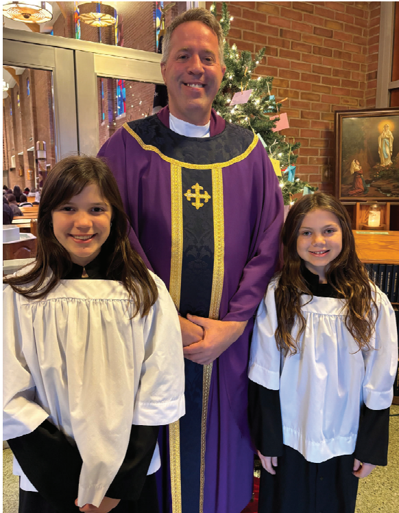
Called to Serve!